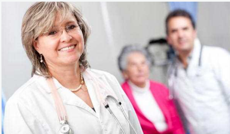
SinusitisSinus InfectionChronic SinusitisEndoscopic