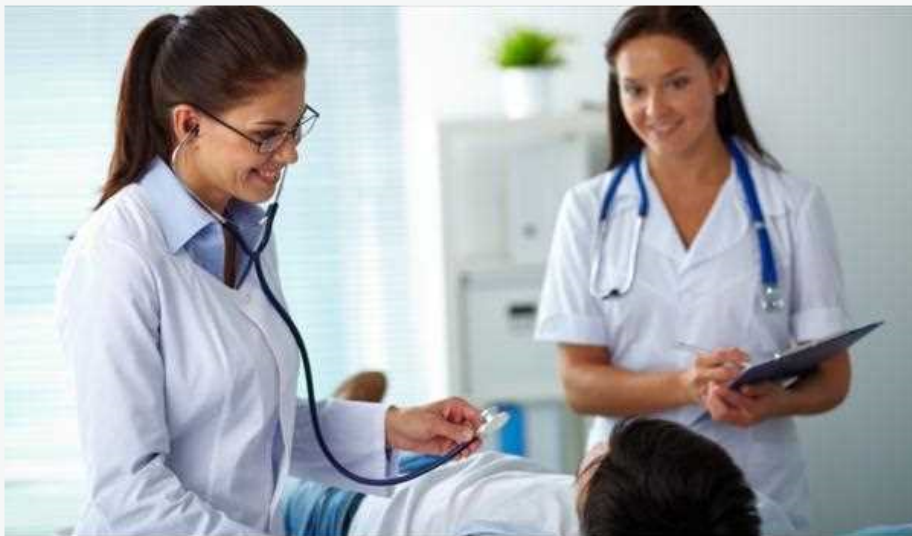
Sinus Infection Sinus Infection Symptoms Infection Symptoms Headaches Sinusitis Nasal

Although these conditions are sometimes confusing, there are simple steps that you can take to determine which exactly you are suffering from. You can rule out dental problems if you are already having some other sinus infection symptoms such as runny nose, headaches, clogged nose, post-nasal drop, a sore throat, or facial pain. If you have a history of a sinus infection, then it is possible that you are experiencing another bout and the pain in the teeth which you are feeling is actually a sinus infection toothache .