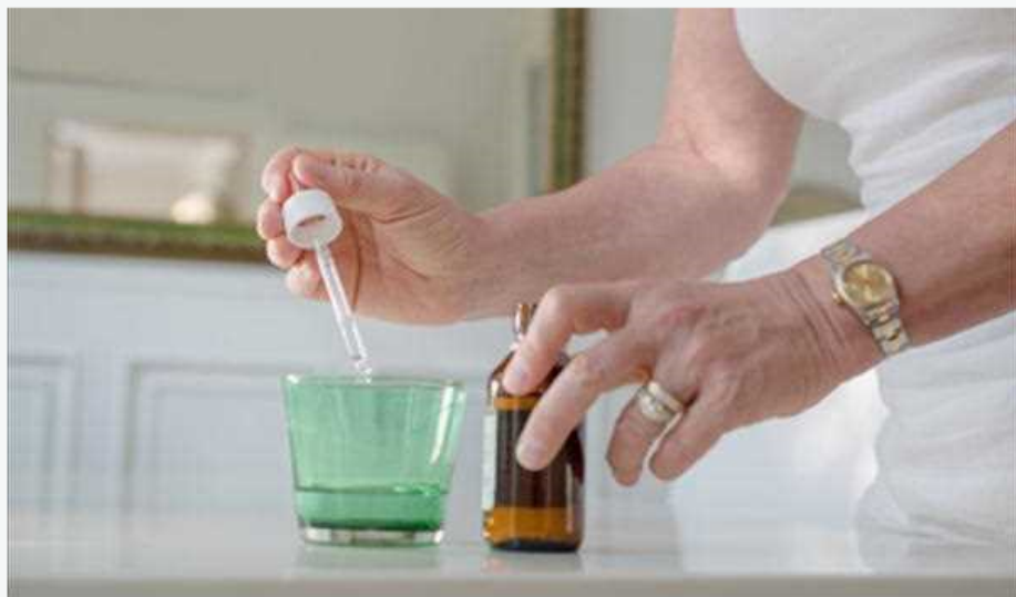
SinusitisChronic SinusitisSinus SurgerySinusitis ChronicTreating

Aerosolized Treatment One of the most advanced treatments available today is aerosolized nose treatment in order to ease chronic sinusitis. Patients who have undergone this type of therapy are very pleased and astonished with the results of the process. Together with aerosolized nose therapy, liquid medication (antibiotic, antifungal, and/or anti-inflammatory) will be nebulized using a small and lightweight nebulizer device. Whenever liquid medication is pumped from the nebulizer, the mist breathed in by the patient immediately would go to the sinus cavity. Sinus relief is quick and efficient.