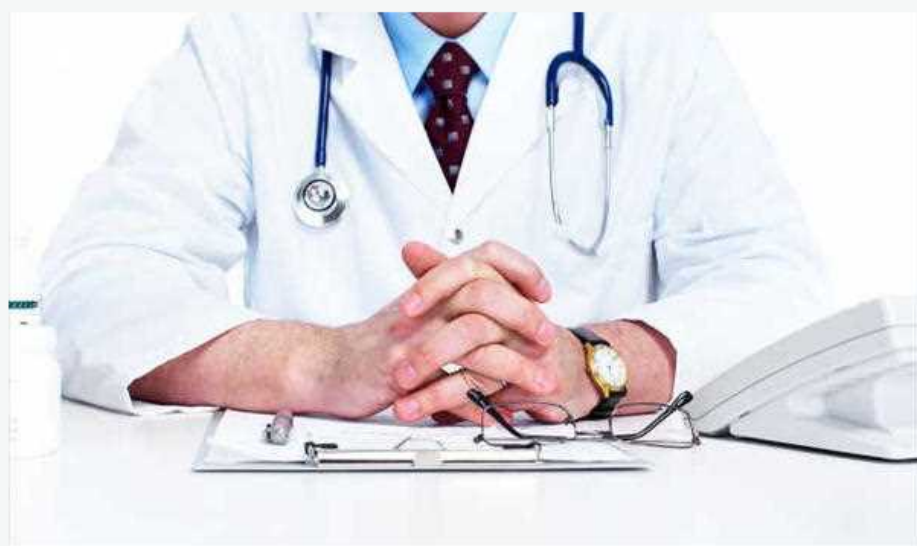
SinusitisHeadachesSinus HeadachesSinus InfectionSinus

When the nose airways obtain blocked by dried out mucous, each day mucous continues to pack up and so leading to a rigid nose. Do not get virtually any sinus treatment in which dries up the mucous or perhaps antihistamines as they will simply merely worsen the issue as well as make the rigid nose worse. This would make it hard to drain the sinuses and there is greater pain from the accumulation of thick nasal and sinus mucus.