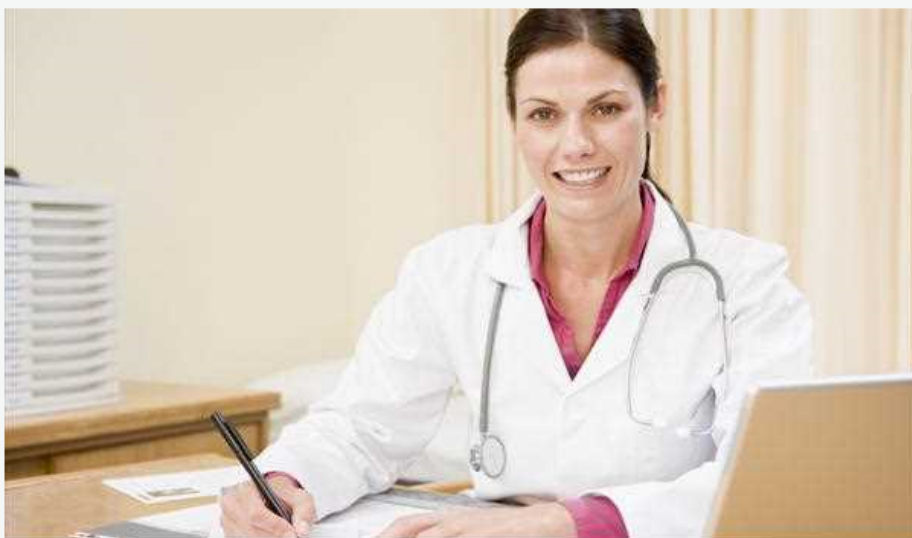
SinusitisSinus ProblemsFrontal SinusEthmoid SinusitisSinus

The nasal saline irrigation approach with the use of a Neti container is the best ways to treat sinusitis vision problems. This treatment involves the use of a salt and water solution to flush out the nasal cavity. The Neti pot is a ceramic pot that has been in use in ayurvedic and yoga as a form of natural treatment. Several ear, nose, and throat surgeons recommend sinus sprinkler system to pay off the sinus passage. This helps to thin the mucous and eliminate it out of the sinus passages. The cilia, which are small hair-like structures that line the nasal and sinus cavities wave back and forth, pushing the mucus back into the neck or to the nose so that it can be blown away.